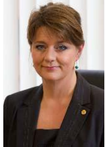
Leanne Wood AM Leader of the Party of Wales

“Only the Party of Wales can and will put Wales first at all levels of government, each and every day.”